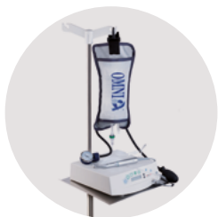
STAND FOR PHYSIO- DISPENSER

The stand with wheeled base is made of stainless steel. It allows positioning and supporting the OMNI-VAC aspiration system, and the wheels allow moving it easily around the surgical room. The tray may be used as a shelf to support the Physiodispenser.