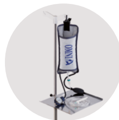
SUPPORTING TRAY FOR HAND FUSER